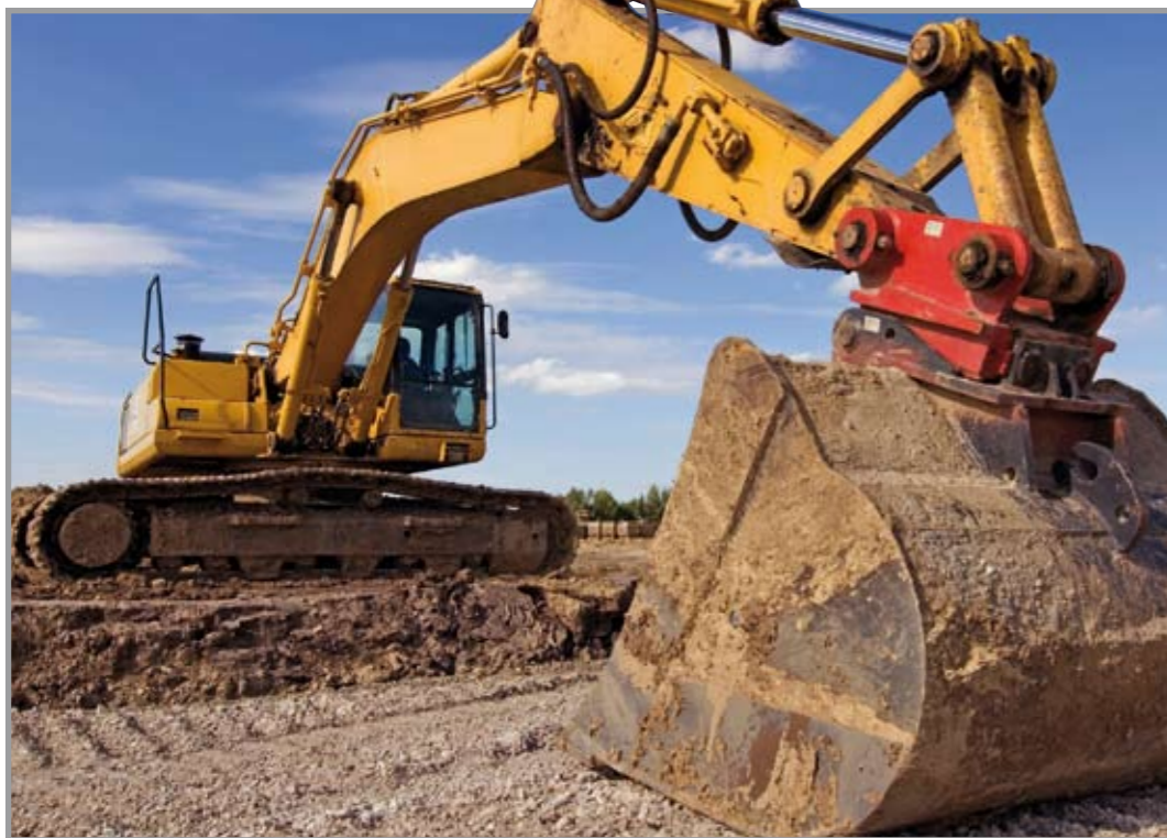
ABOVE: Integrated filtration systems cut leaks and improve efficiency RIGHT: The latest filters can reduce initial build costs by up to 25%

DESIGNED TO SAVE SPACE AND IMPROVE PERFORMANCE, THE LATEST RETURN LINE FILTRATION TECHNOLOGY FOR USE IN PLASTIC RESERVOIRS IS WELL WORTH SEEKING OUT